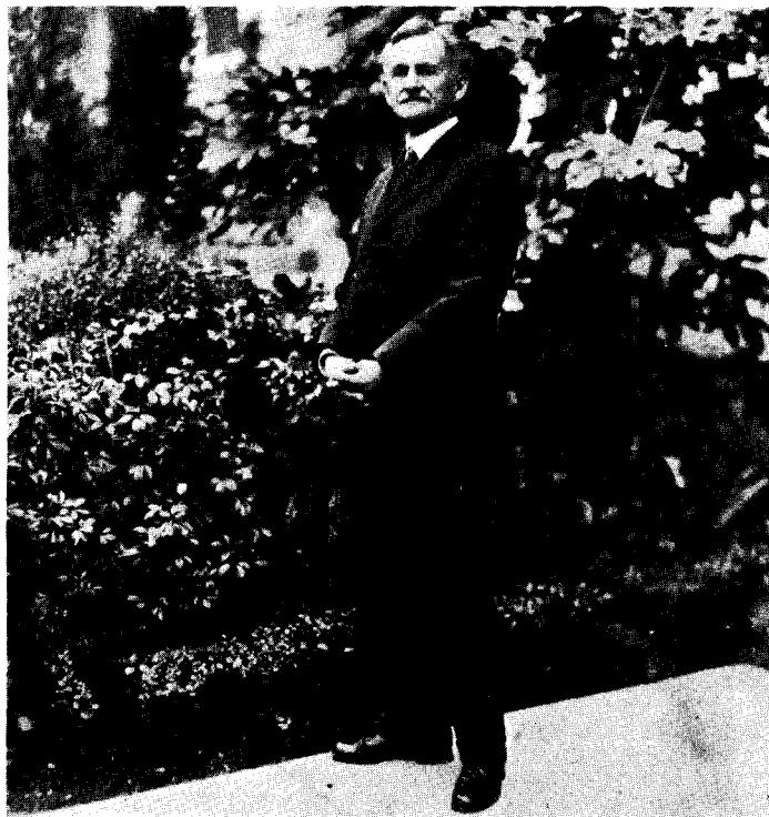
MICHELSON IN HIS SEVENTIES